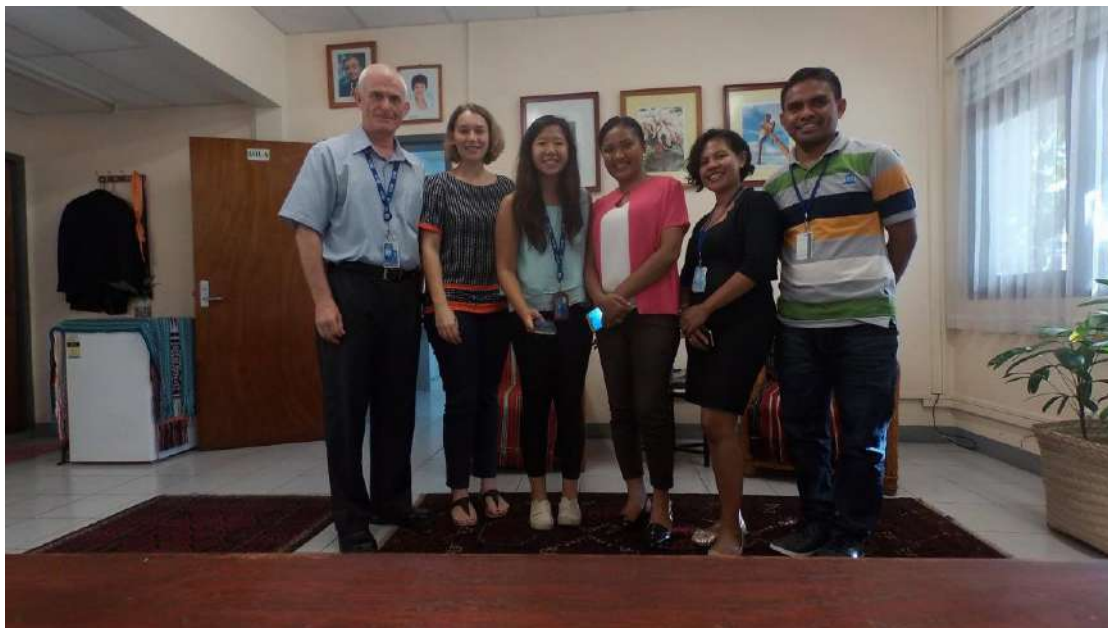
The Resident Coordinator Office colleagues.

have to assign a colleague into the UN Cares team that represent their agency presence. The team provides support that relates to AIDS and it also promotes educational materials within the compound. I co-coordinated the “UN for all” workshop during my assignment and it was an inspiring task. How would we address LGBTI people? How would we address HIV+? How would we address disabled people? The true is we all have some answers to these questions, and the best way to address them should be by their names. The aforementioned was only one of a small sparkling point throughout my learning. Yet, it showed me why would the United Nations be one of the most ideal working environment, as not just colleagues trained to work in different environment, cultural background, and also respect to all kinds of people. The idea of UN Cares might not be extremely useful at our first sight, yet, the meaning of the team is highlighted when this world renowned entity set a good example for other entities. Besides advocacy, the team actually support in a medical way, where it provides free HIV testing to all colleagues and their family members, 13 PEP (Post Exposure Prophylaxis) kits are always available in country office serving for emergent needs. (PEP kit could kill HIV bacteria within 72 hours after exposure) The support and knowledge the UN contains truly tend to turn UN a role model that other organizations look up to.