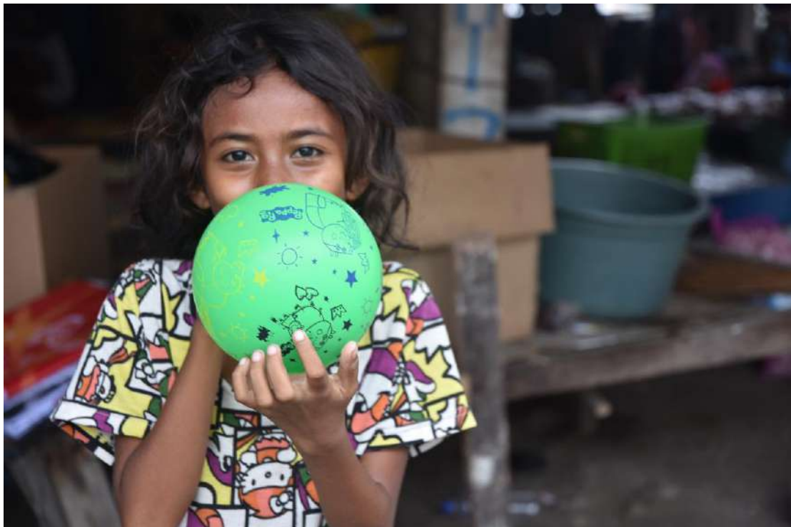
Lovely Timor young girl.

All these exposure do inspired me in different directions for my future careers. I became even more conscious on how blessed we are, from a place with good education and resources ,we are indeed previliaged to give to the underpriviliaged.