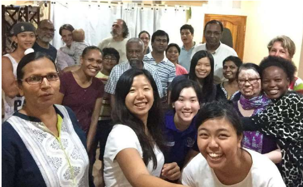
Me and my churchmates

5 months, we can hardly call it a long period, of time yet, it didn't make me feel short at all. 5 months in the United Nations system, 5 months in a mature working environment, 5 months in a least developed country and 5 months being treated as a capable grown-up. I could go on and go for my reflection and stories, To commence with, I am, just, super thankful for this priceless opportunity provided.