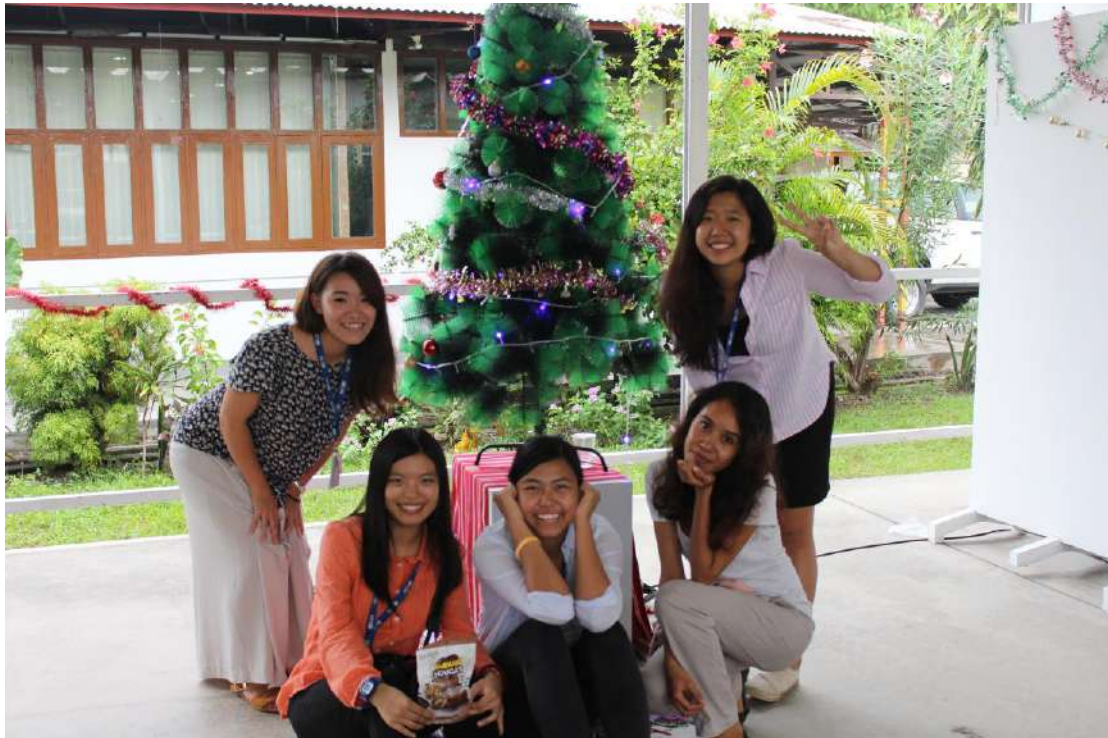
Christmas Party hosted by RCO.

own way and it is surely more suitable for the context. I truly appreciate how colleagues respect one another and provided a really ideal working environment. Besides shaping the UN as a role model and ideal working environment, I also felt that UN is training the trainer as a springboard for national staff. Majority of UN staff do not have long term bidding contract and this allow many of them enroll in their government system after working for the UN. These former national staff could then carry the great values, such as zero discrimination and mutual respect to the governmental workplace. When others are judging UN as a paper tiger, criticizing that there are so much that UN could have done better, working inside this system gave me another perspective of the word “contribution”.