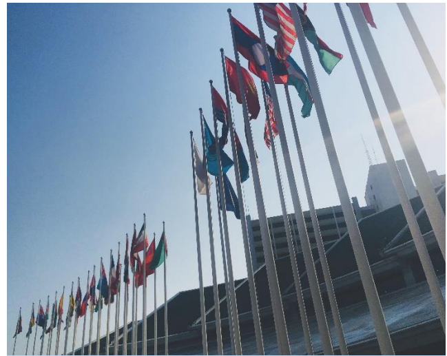
United Nations ESCAP

Volunteer has always been my hobby since I was a little kid and wanted to do it in a professional way. This mind guided my choice of study in high school and university. But extra-curricular activities are always not regarded as important or even be banned by the teacher because they distract the concentration on studies before attending the university. This assignment means quite a lot to myself before starting, which not only proves my dedication to volunteerism but also personal ability. But a lot more meaning has been added to it during the six months. I will talk about it later.