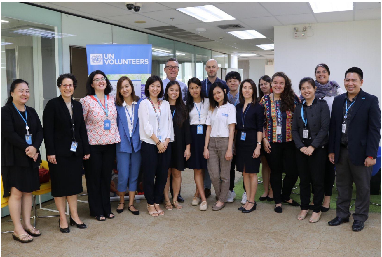
UNV Thailand Meeting