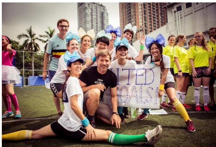
Soccer Team Photo with “Jamie”

With regards to the people, my supervisor was really good at coaching an inexperienced student to adapt to work and get to familiar with different technical terms. Moreover, balance was his working motto. For the first week he asked me to learn the basic knowledge in the morning and spend every afternoon to learn about the Bangkok city, or even the country. And during the six months, I got chances to explore skydiving, scuba diving and even got a professional certificate. What would be the most exciting was that I even had a chance to play soccer with “Jamie Lannister” (A character in the famous TV show: Game of Thrones)!