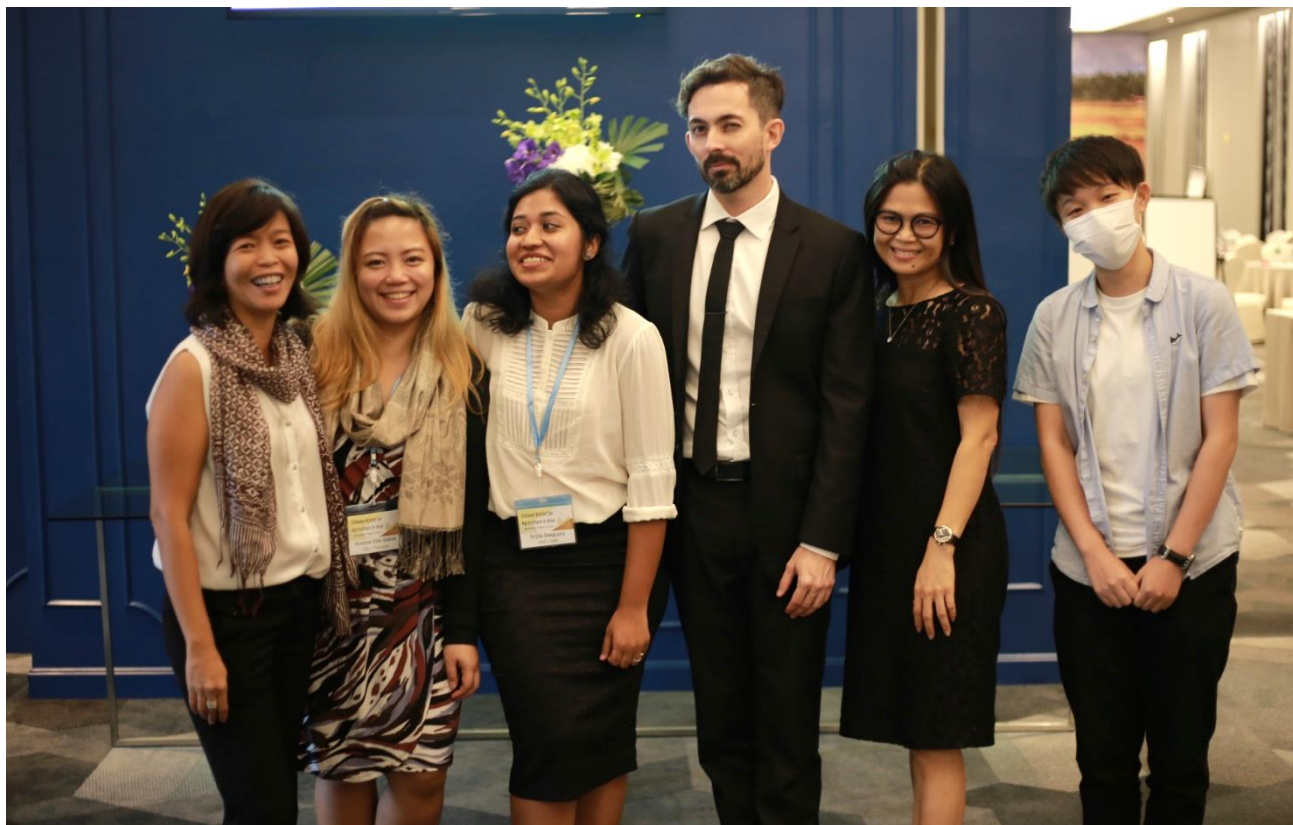
Team photo with some workshop participants