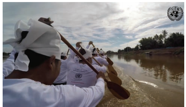
Filming on a speedy boat wasn't easy yet I had so much fun on that shooting day.