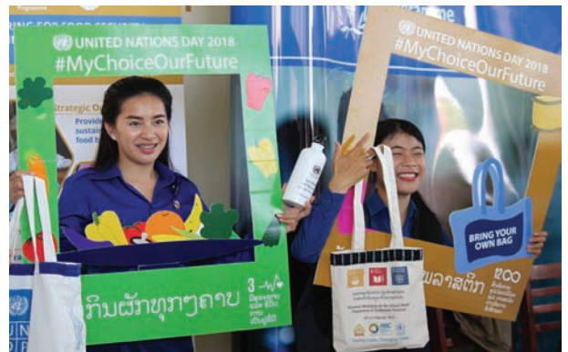
Lao youths were taking photos with the the photo frames to help promotes healthy lifestyle on the UN Day.