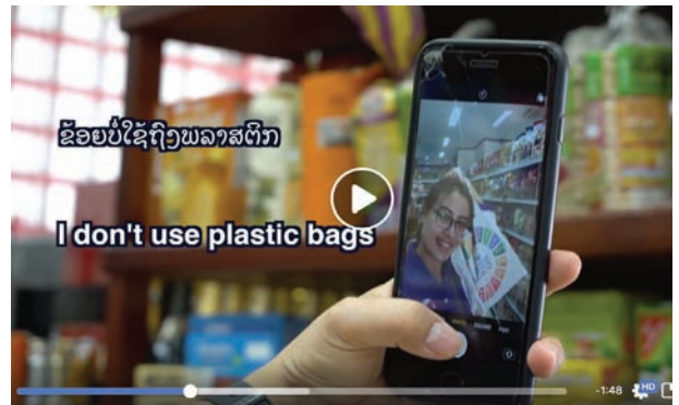
The video demonstrating environmental friendly practices

Apart the youth event and social media campaign, the PIU team and I have filmed and edited a short video describing how the UN country office promotes plastic reduction by supporting a boat-racing team in Laos. My teammates and I were facilitating each other in order to get quality photos, shots and interviews for future publications. Although the shooting videos on a hot and humid day was uneasy, it was one of my best working days in Laos as I could feel the strong team spirit and have enjoyed my very first filming experience on a 60-seat wooden boat. The film attracted more than 300 reactions and received more than 7,200 views organically on the the Facebook page of UN in Lao PDR.