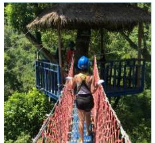
Zip-lining across the forest.