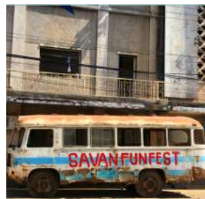
Street view in the town.