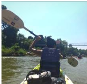
Kayaking in Nam Song River.