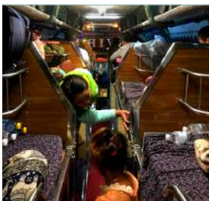
Taking overnight bus to SVK, the bed is shared by two.