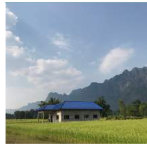
Farm and house on the roadside.