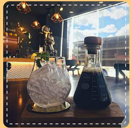
Naked Espresso Premium

After brunch, I would usually take a walk downtown. Laos is a diversified country with 49 major ethnic groups. Each ethnic group has their own distinctive cultures and traditions. I enjoyed wondering around the town looking for handicrafts every weekend. Vientiane does not have the famous brands that we are familiar to. I learned to appreciate the uniqueness in every piece of products and the story it tells. It is depressing to see that the culture that belongs to them are being commodified and stolen by reputable brands without giving them credits, while the local people are struggling to make ends meet as they create their products stitches by stitches. It changes my spending behaviour when I realised the money that I am casually spending is actually a vote to an ideology and power imbalance is not what I would vote for.