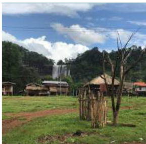
Ethnic village on Bolaven Plateau and the view of waterfall from far.