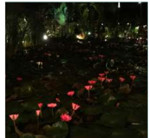
Lotus pond in Manda de Laos.