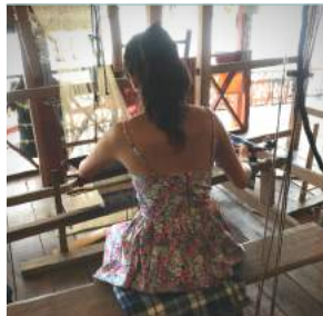
Silk scarf weaving lesson with Master Weaver in Ock Pop Tok.