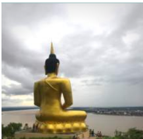
View of Mekong River from Wat Phou Salao.