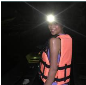
Headlight is provided as the cave is in complete darkness.