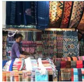
Textile store in Whisky Village selling scarves and sinhs (Lao traditional dress).