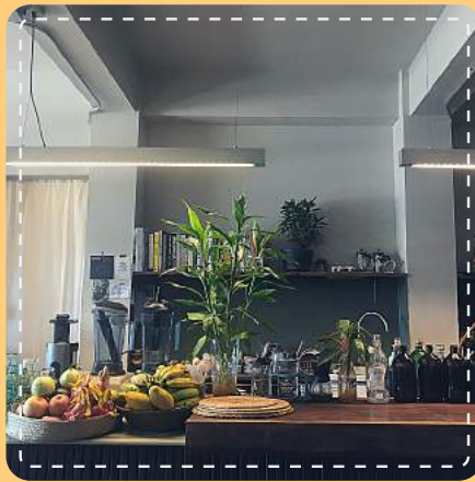
The Cabana Café