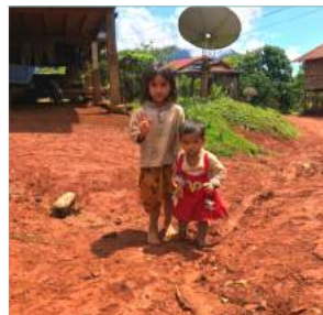
Friendly young villagers greeting us with "Saibaidee" (Hello).