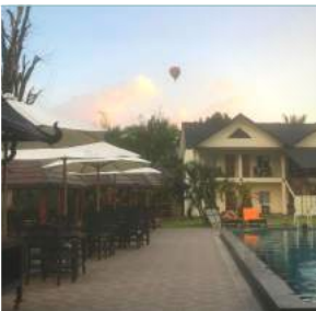
Hot air balloon during sunset.