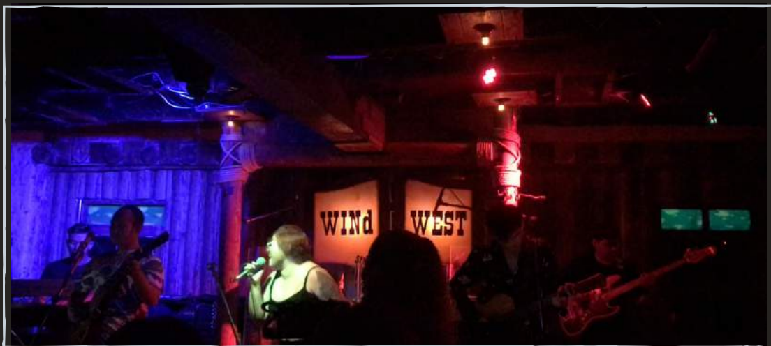
Wind West Pub