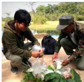
Lunch with local villager who was also our trekking guide.