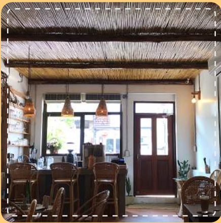
Especial Café & Bar

Waking up to the warm and comfy sun, my weekends in Vientiane usually started off with a search of café. Much different from Hong Kong, cafés in Vientiane are spacious and tranquil. You could spend your whole day there undisturbed. Locally planted coffee is another highlight. Mostly originated in Bolaven Plateau, the southern part of Laos, their coffee is usually strong with rich aroma. Each café serves their own blend of coffee with different brewing methods. Be sure to check it out if you happen to be in Vientiane, but remember to tell them “Bor Waan” (Not sweet) and “Nam Gon Noi” (Little ice) if you do not like sugar and lots of ice in your coffee like me.