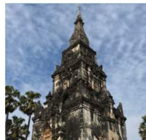
Ing Hang Stupa during That Ing Hang Festival.