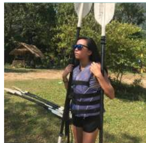
Listening to safety instruction given by local guide.