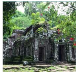
The sanctuary of Wat Phou on the mountain.