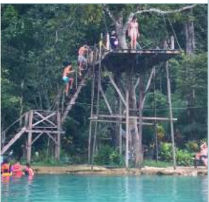
Blue Lagoon 2.