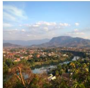
View of Nam Ou River from Mount Phousi.