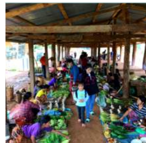
People in the town would drive a long way to the market of ethnic groups to support them.