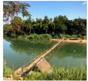
Bamboo bridge across Nam Ou River, only available during dry season and demolished during rainy season.