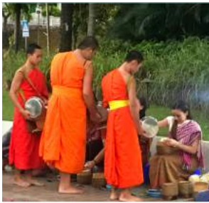
Almsgiving ceremony at dawn.