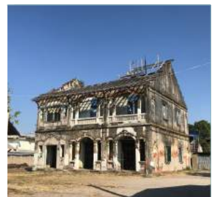
An abandoned building beside Mekong River.