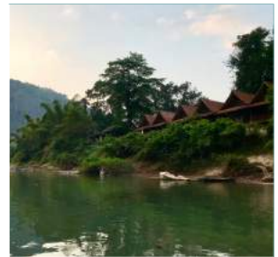
Exterior of Springriver resort.