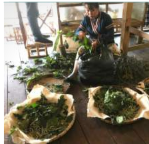
Preparation of silkworms by Master.