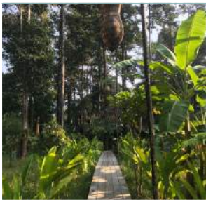
A walk in the Springriver resort.