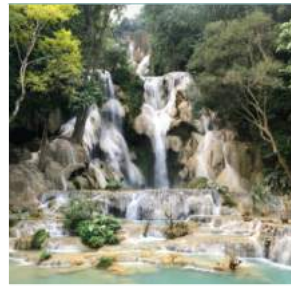
Kwang Si Waterfall.