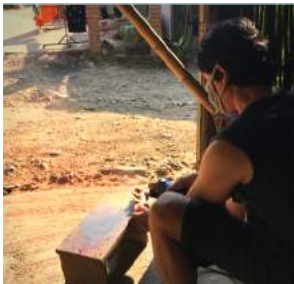
Learning to carve a wood gecko with local craftsman.