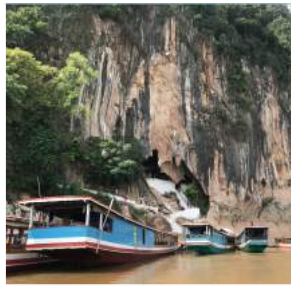
Exterior of Pak Ou Cave.