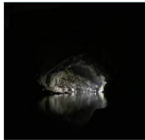
First glimpse of natural light after 7.5 metre long of darkness.