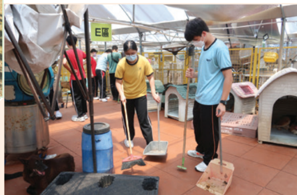
學生投入參與聯校培訓和 義工服務 Students actively participated in the joint-schools training and volunteer services