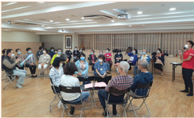
學院為不同界別的機構團體量身設計各類培訓項目 IoV tailor-made training courses for organizations from various sectors

The Specialized Training Programmes are tailored according to the needs of individual organizations. These include basic volunteer training, service skills training, leadership and volunteer management training for volunteers, volunteer leaders and management staff. Training service was delivered online and offline to cope with the pandemic situation. During the year, 80 organizations were served, including Hong Kong Public Libraries, Hospital Authority, HSBC, ICAC, Leisure and Cultural Services Department and Urban Renewal Authority. To ensure quality, all training programmes were conducted by IoV qualified and experienced staff and volunteer trainers.