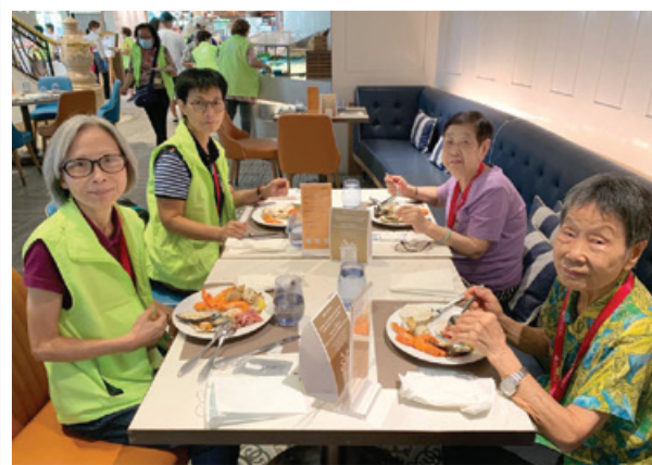
「耆義聯盟」義工與長者慶祝中秋節，在酒店享用自助餐 'V-Union' volunteers celebrated the Mid-Autumn Festival with the elderly, let them enjoy a buffet at hotel

Along with the technological development, gerontechnology products were introduced to enhance the quality of centre services. In the year, granted by SWD's 'Innovation and Technology Fund for Application in Elderly and Rehabilitation Care', WGE rented a social robot over a two-year period to provide cognitive training for the elderly with dementia.