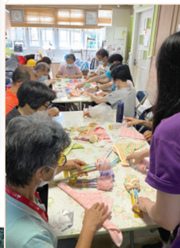
義工組長隊在疫情下帶領香港義工團會員參與不同的義工服務 The Volunteer Leaders Team led the HKCV members to participate in different services during the outbreak of pandemic