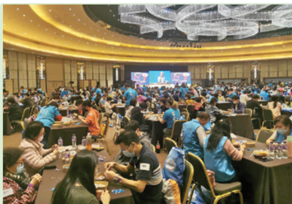
義工獲轉介參與不同的服務 Volunteers were referred to various services

With funding from The Hong Kong Jockey Club Charities Trust, AVS launched a new volunteer digital platform – 'Volunteer Hongkong' (V-HK), which allows volunteers and volunteer-involving organizations to conduct membership registration, volunteer recruitment, service matching and management in one stop. To promote volunteering, a 3-year strategic plan of HKCV was formulated again in the year. Currently, there were 8,350 individual members and 203 corporate members on the register, with about 40% of the individual members being youth members.