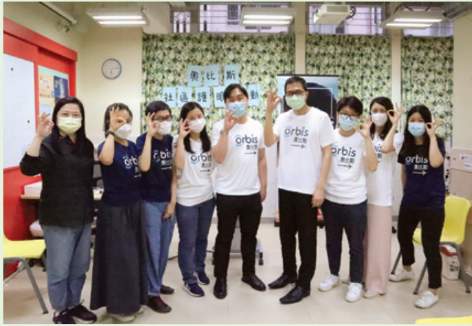
中心與奧比斯合作舉行「亮眼行動 — 眼睛檢查日」，為長者提供全面的眼科檢查和諮詢服務

In collaboration with Orbis, a visual health check activity was held to provide the elderly a comprehensive eye examination and optometric consultation service