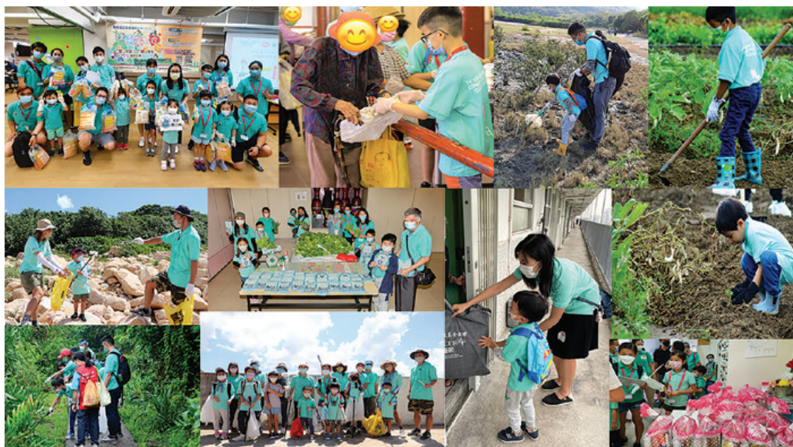
家庭義工隊在暑假期間推出一系列義工服務，包括清潔海岸、慈善種植和派發農作物及探訪 Family Volunteer Team organized a series of services during the summer holiday, such as coastal cleanup, charity farming and vegetables delivering and home visits

The Teams provided volunteer services through online or other new means amidst the new normal. While their services resumed normalcy gradually, nearly 28,000 hours of service were provided to 82 organizations by 1,900 volunteers, benefiting approximately 124,000 service recipients. The satisfaction rate of the user organizations was 100%. Team members received a total of 5,804 hours of training. Despite the pandemic limitations, volunteers endeavoured to continue applying their specialized skills to serve the disadvantaged. For instance, they recorded videos, made greeting cards or handicrafts at home, and communicated and interacted with service recipients by online means.