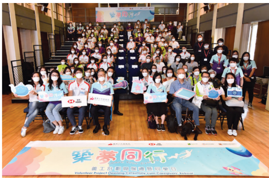
本局為滙豐義工提供義務工作及領袖培訓 AVS provided volunteering and leadership training to HSBC volunteers

AVS joined hands with Hongkong Bank Foundation to launch the ‘Share Your Dreams’ Volunteer Project to fulfill the dreams of 40 vulnerable elderly and children/teenagers with rare diseases. With the effort of HSBC volunteers, the Project combined the strength of volunteers and cross-sectoral collaboration to build a caring and inclusive society. Working with the partner NGOs Aberdeen Kai-fong Welfare Association, The Neighbourhood Advice-Action Council and Rare Disease Hong Kong, the Project was rolled out in August 2021 and implemented in three stages. AVS provided volunteering and leadership training to about 200 HSBC volunteers and arranged AVS volunteer leaders to support the planning of activities in realizing the dreams of service beneficiaries, including taking wedding photos, recording albums, running art exhibitions, making handicraft products, learning music and artistic skills, enjoying a day trip in Hong Kong, etc. The Opening Ceremony cum Caregivers’ Retreat was held on 4 September 2021 at Jao Tsung-I Academy to kick-off the project and provide a relaxing and healing day for the elderly and their caregivers.