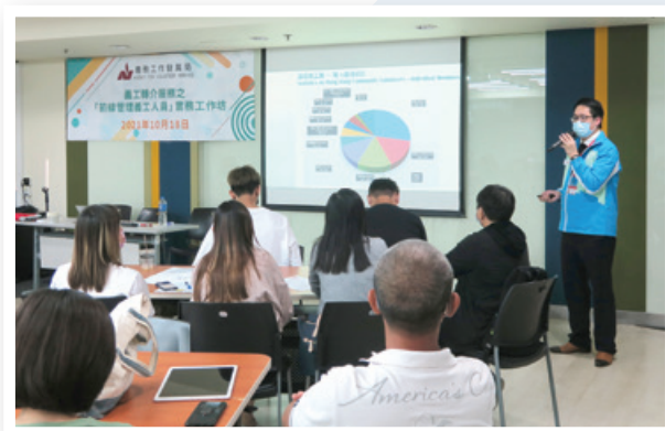
每年舉辦的「義工管理人員 實務工作坊」 Volunteer Management Workshop was held annually