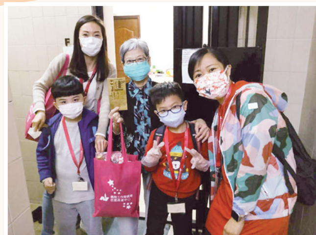
中心為長者會員舉行多場小型新春聯歡會，並透過「新春送暖大行動」，在疫境中為他/她們帶來歡樂 To celebrate Chinese New Year, WGE organized mini-gatherings and paid caring visits to the elderly