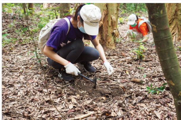
青年參與‘Miracle Summer’服務 Young people actively participated in the services of ‘Miracle Summer’

‘Miracle Summer’ Youth Volunteering Programme was initiated in 2016 to encourage young people to make the most of their summer vacation by volunteering, and through the process to develop their communication skills and self-confidence. ‘Miracle Summer’ 2020, with the theme ‘Environmental Protection, Cherishing Food and Care for the Community’, selected various service events for youth aged 12 to 30. Although some events were cancelled amidst the pandemic, the Programme still engaged 115 young volunteers to perform a total of 1,072 hours of service. The Programme also attracted 76 young volunteers to get registered with HKCV.