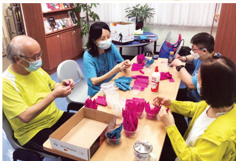
義工組長隊在疫境下仍然積極參與不同的服務及活動 The Volunteer Leaders Team participated actively in different services and activities during the outbreak of pandemic

In order to strengthen the effectiveness and quality of volunteer service, the Volunteer Leaders Team was established in 2006. Based on the concept of 'volunteers manage volunteers', experienced volunteers were appointed to assist in leading HKCV members to serve in large-scale service events. The Team, consisting of 81 members, was divided into small groups to provide support to 38 service events which included 'Flash Mob Volunteer Service in 18 Districts' that mobilized volunteers to distribute anti-virus packs to 1,500 front-line cleaning workers and security guards, and caring community services to support social welfare organizations and enterprises in distributing caring packs to 500 elderly and ethnic minorities. The team also led volunteers in the 'Together • We Plant' Volunteer Greening Day to celebrate AVS' 50 th Anniversary. To share knowledge and to promote unity among team members, 2 online training workshops namely 'Dementia Friends' and 'Workout at Home. Act Together to Fight Coronavirus' were organized.