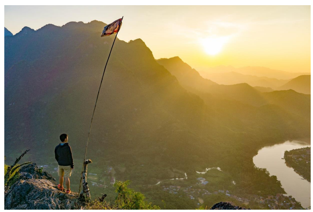
The nature of Laos was very well preserved and breathtaking. This picture was taken during sunset in Nong Khiaw.