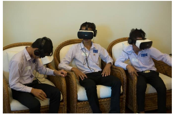
I represented UNV and UNDP on the UN Day to show the UXO Virtual Reality film to the 150 school kids visiting the UN House.

In December, UNV in Lao PDR organized a development dialogue and a blood donation drive to promote volunteerism and celebrate the IVD. I participated in the preparation committee, helped organize the events and designed publication materials and T-shirts. Almost a hundred of young Lao attended the development dialogue and listened to sharing from different passionate local volunteers. Collaborating with Lao Red Cross and Lao Youth Union, we successful mobilized hundreds of young people to donate blood.