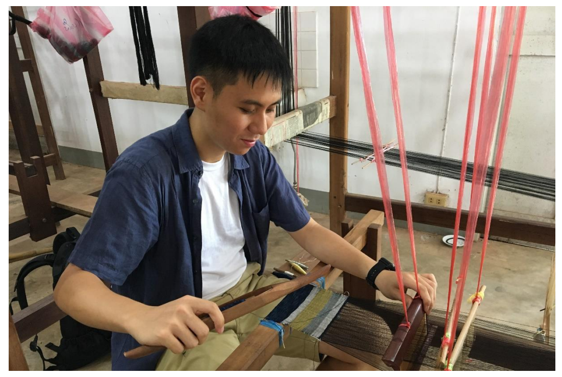
Textile is one of the best products in Laos. We attended a weaving workshop to learn this gem of Lao culture.

Working at UNDP was an invaluable opportunity that polished my personal and professional skills. The very multicultural setting helped me gain more experience working with people having different working styles and culture. Thanks to the tasks I was given during the assignment, I am now better equipped with professional skills and knowledge which will be very useful in my future career.