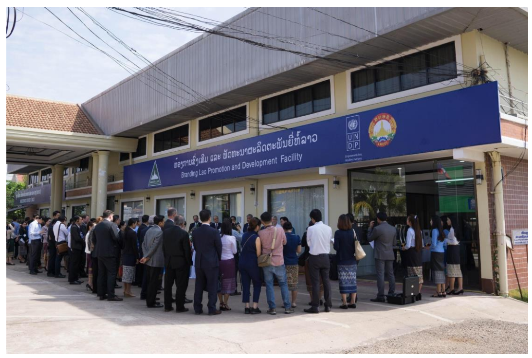
The Branding Lao Promotion and Development Facility was officially opened on 2 November 2017

In a country like Lao PDR with very few high profit margin and value added economic opportunities, the project is of great importance. Currently, economic development of Lao PDR is mainly driven by the export of natural resources, including minerals and energy generated via hydro power, but not much employment and livelihood is created as a result, leaving approximately 70% of the population working the agricultural sector. With simple and primitive agricultural methods, the sector is low in productivity and highly vulnerable to natural hazards. To lift people out of poverty, it is crucial to provide more economic opportunities to the people and raise the profit of their production.