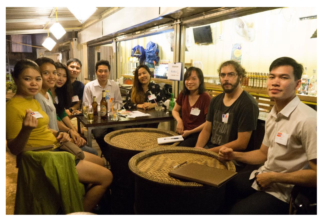
The first Bla Bla Language exchange

On the weekends, I often enjoyed a cup of brewed coffee and read books at one of the many good cafes in town, such as Joma, Sinouk Coffee, Le Trio, The Little House and Comma Coffee. Among them, I especially loved visiting the Little House, which was owned and