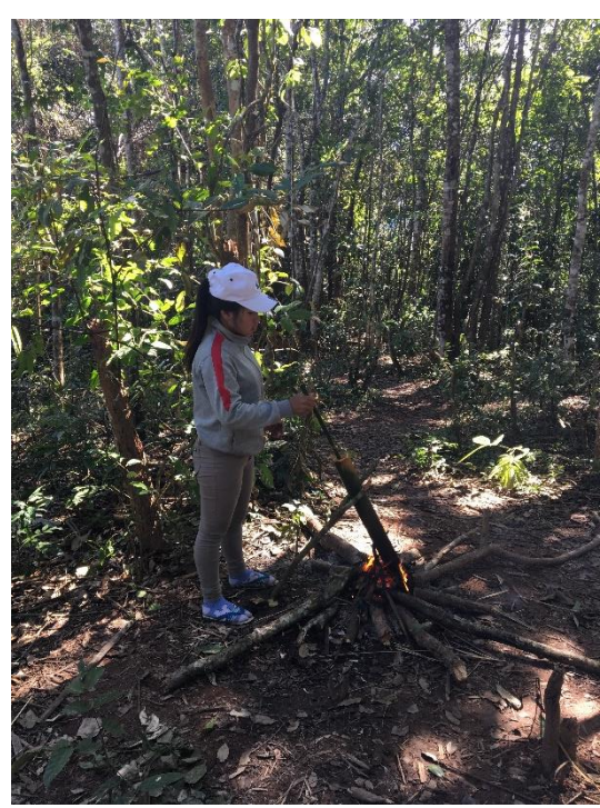
One of the guides used bamboo in the jungle as a pot to cook

During long weekends and holidays, I usually travelled to other cities, such as Luang Prabang, Luang Namtha and Oudomxay. In Luang Namtha and Nong Khiaw, I joined two-day trekking tours respectively, in which I could visit the remote ethnic minority villages and stayed at their place. These two tours were best parts of my six-month journey in the country, since I could closely observe and taste a bit of the lives of the Khmu, the Hmong and the other ethnic tribes. These tours are guided by guides from local ethnic tribes, who are naturally trained to survive in the jungle. They cooked in the jungle with ingredients and utensils from the jungle. In one of the tours, I stayed in a Khmu village with no electricity and mobile network single. The kids did not have toys to play but only pebbles. Though there were a few water taps in the village, the villagers chose to bathe in the river and wash their clothes there. They were self-sufficient by growing their own food. They had a very sustainable way of living and made very good use of all the resources given by the nature. Their simple but happy lives may be something people from the modern world long for.