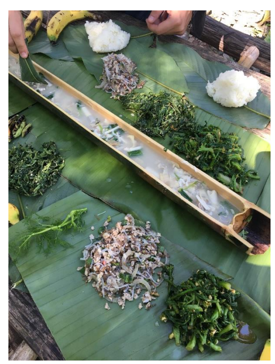
Food was served on leaves and we used spoons made with leaves to eat.