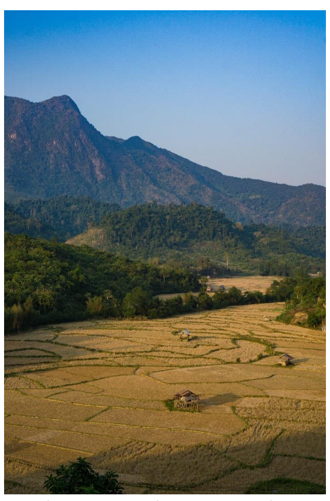
Sticky rice is the main staple food in Laos. Rice farm can be easily found anywhere in the country.