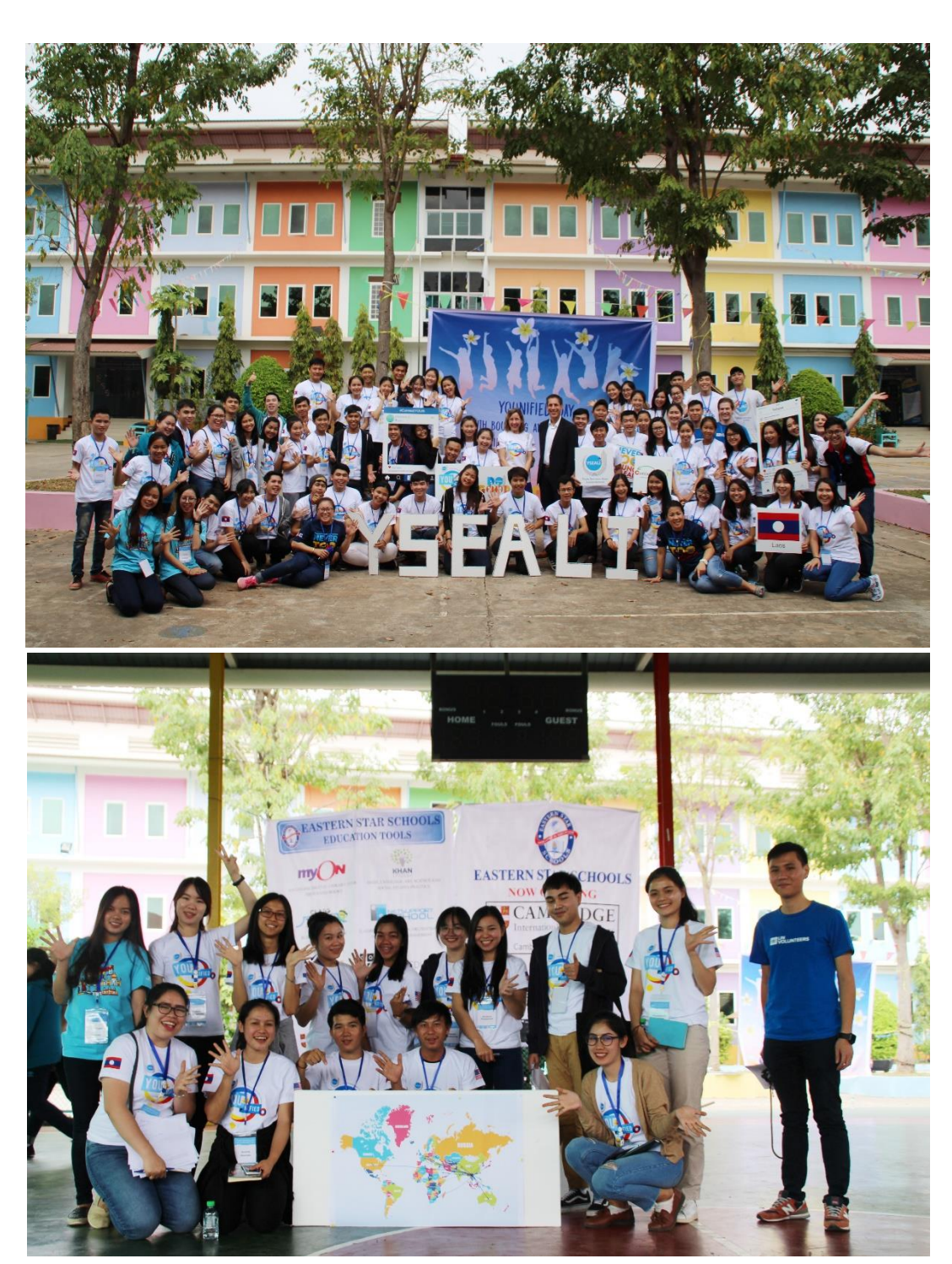
60 passionate local university students attended the Younified Day and got to know more about SDGs and volunteerism.

Moreover, I supported the Younified Day, an SDG awareness event organized by YSEALI Laos, by facilitating some activities and introducing participants UNV and volunteerism. The event encouraged 60 local university students to become active in shaping their country and contribute to the Sustainable Development Goals (SDGs). The students devoted themselves in the activities and became knowledgeable in SDGs.