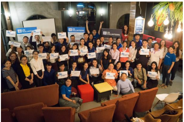
We invited local Lao volunteers to share their stories with young people. Almost a hundred young people attended the development dialogue.