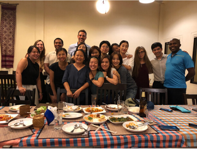
Shout out to the fam!