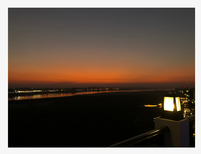
Can never get tired of the sunset in Vientiane