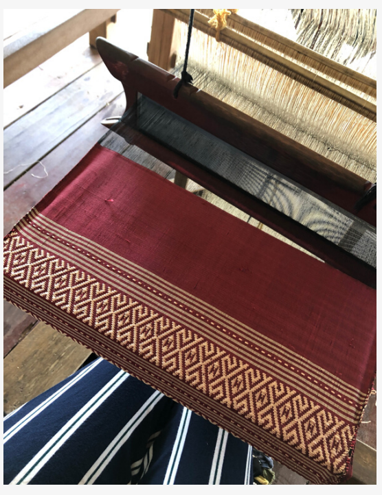
First tie-dying and weaving experience!