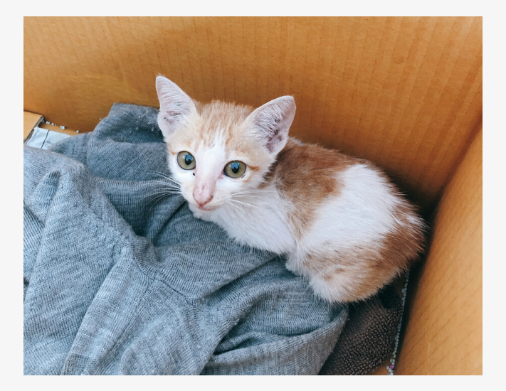
The dog-like UN cat, and Casper, the kitten we saved at the UN house!