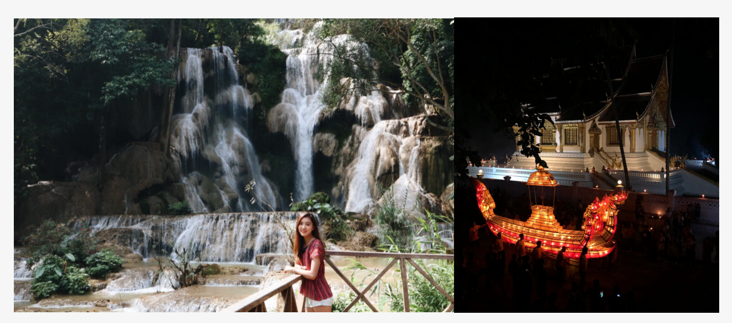
Stunning water fall and parade in Luang Prabang!