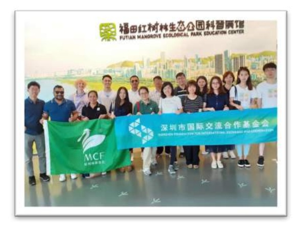
Visiting the ecological park in Shenzhen

In August, I represented the Office to participate in the Shenzhen International Low Carbon City Forum, where I learnt a lot about the new technologies and initiatives in low carbon infrastructure and green city. During the Forum, I also met other participants, mostly the government officials from Southeast Asia, and promoted the idea of South-South Cooperation to them.