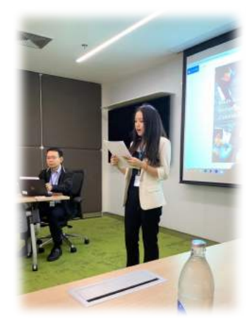
Being MC at a seminar

In these few months, I also got many opportunities to push the boundaries of my own comfort zone. As someone extremely anxious about public speaking, I challenged myself to be the MC of a seminar organized by our office. At an exhibition of development agencies organized by the Thai government, I also made an effort to speak to the participants to promote South-South Cooperation and UNOSSC.