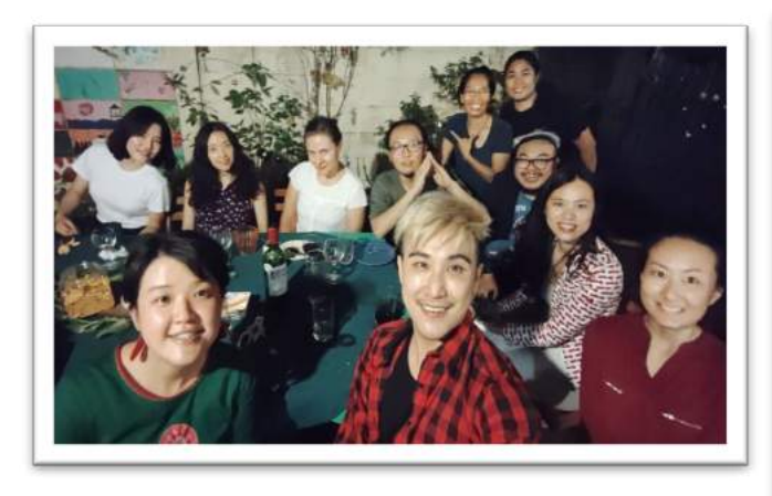
Open dinner at ATD Fourth World